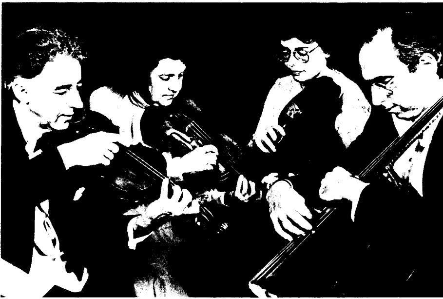
The Composers String Quartet

In the event the Islanders climb into the NHL playoff and champion-