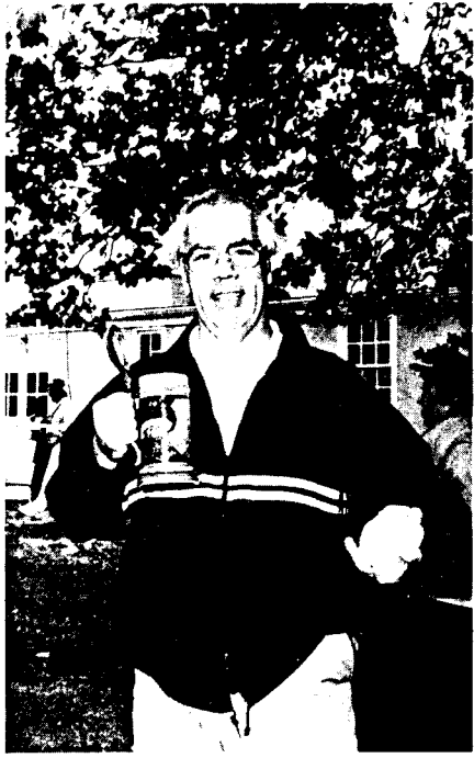
picnic photos by [unreadable] [unreadable] ton.