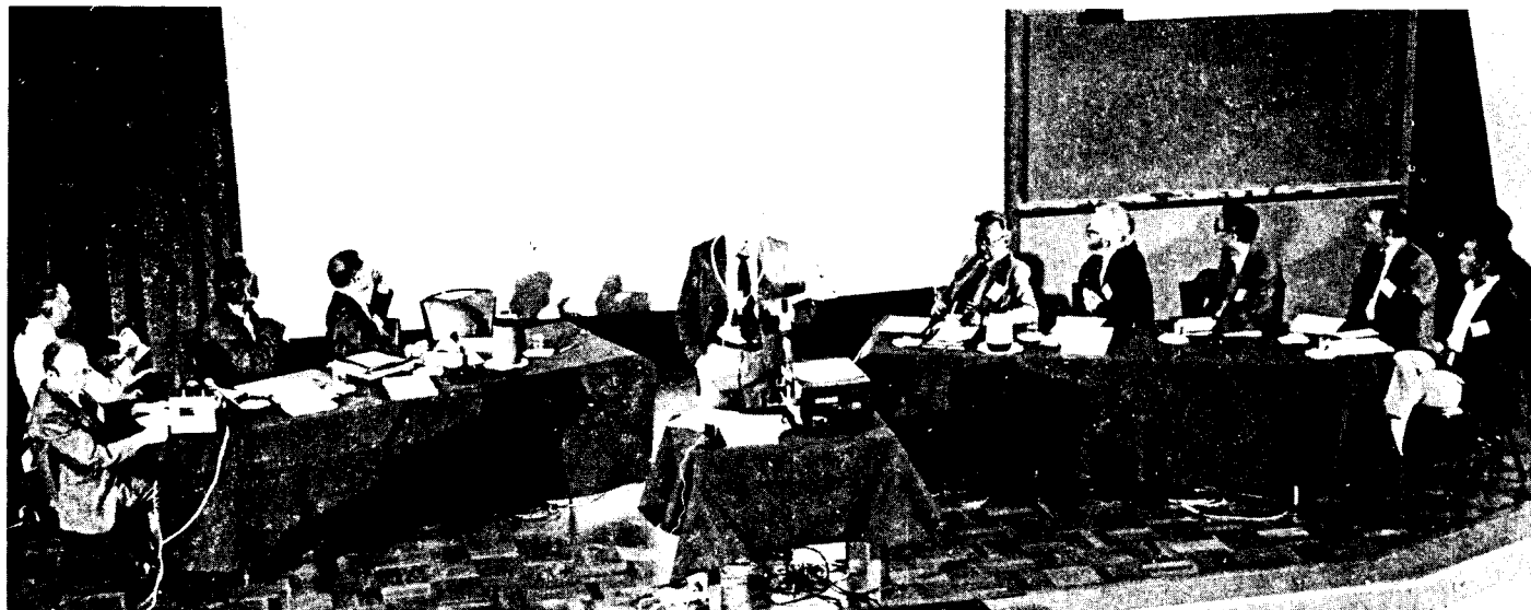
The heads or leading representatives from nine of the world's major accelerator facilities offered their personal viewpoints in the first panel on "Future Cooperation in Accelerator Construction," then fielded questions from seminar attendees in the

Four ICFA panels had been established, to stimulate worldwide cooperation in high energy physics research and development, as a direct outcome of the 1984 seminar. The recommen-