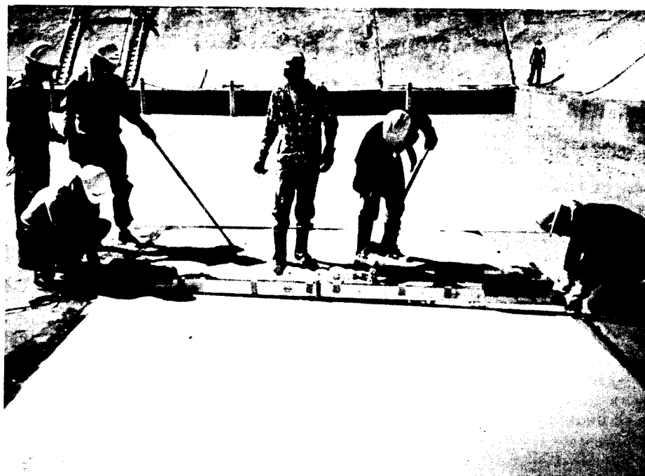
Last summer, workmen installed insulating polymer concrete to overlay the LILCO's Holtsville dike.

Guidelines regarding selection of students have been distributed to research department offices. If interested, please contact your department coordinator.