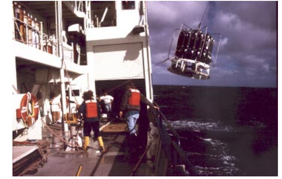
During the recent research cruise that BNL participated in on the Indian Ocean, crew members of the R.V. Knorr bringing the deep ocean water sampler aboard off the coast of Madagascar. In the sampler, 36 separate 10-liter bottles close at different depths as a result of cable signals from on board the Knorr .

Anthropogenic carbon dioxide is partitioned between the atmosphere, the ocean and terrestrial ecosystems. Computer models have identified the ocean as a sink for approxi-