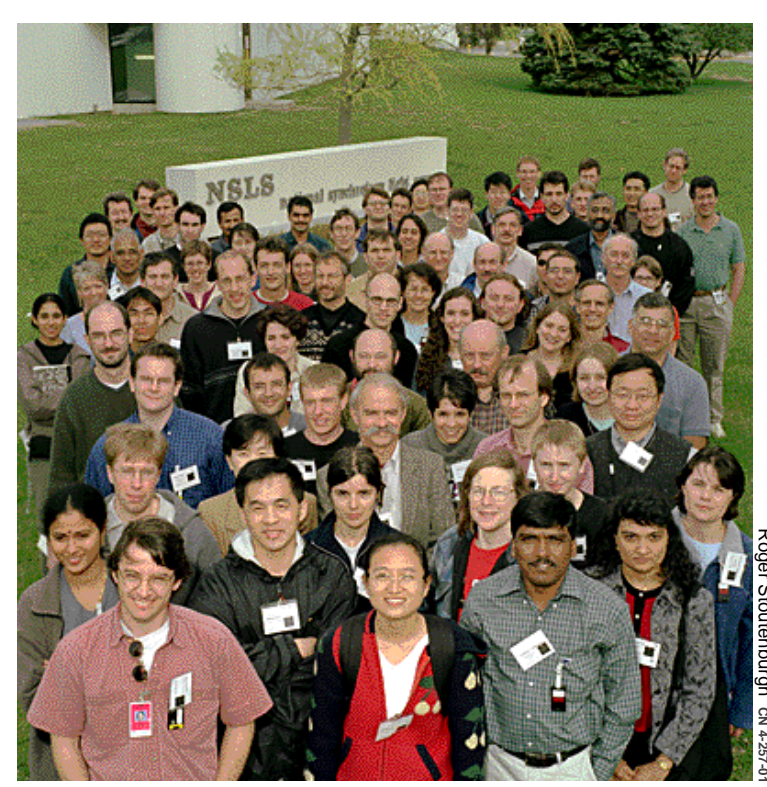
Students and teachers participating in the x-ray crystallography course gather outside the National Synchrotron Light Source.

B^{\,\mathrm{NL's}} National Synchrotron Light Source (NSLS) was extra busy last week as a group of 48 students from around the world participated in a weeklong, hands-on training course. "Rapid Data Collection and Structure Solving at the NSLS: A Practical Course in Macromolecular X-Ray Diffraction Measurement" was developed by the Biology and NSLS Departments to introduce students to the best people, newest equipment, and latest techniques in the field of x-ray crystallography.