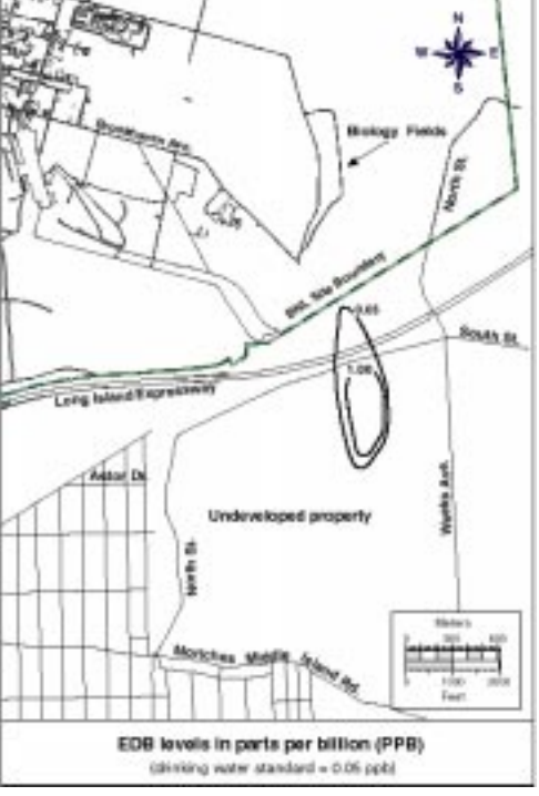
Map of the EDB off-site contamination.

Groundwater in this area contains the chemical ethylene dibromide (EDB) at levels historically measured up to 6.0 parts per billion at depths of 90 to 130 feet below the land surface. Levels measured in recent monitoring are in the range of