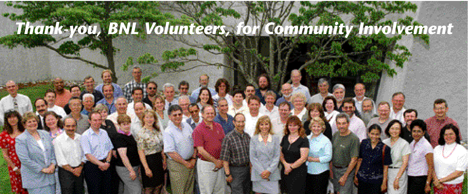
Photographed outside Berkner Hall are some of the many BNL volunteers who have given time to represent the Lab through programs such as the Ambassadors, the Envoys, Longwood Mentoring, Speakers' Bureau, and the Tour Program, most of which are grouped under the umbrella of the Community Involvement Office.