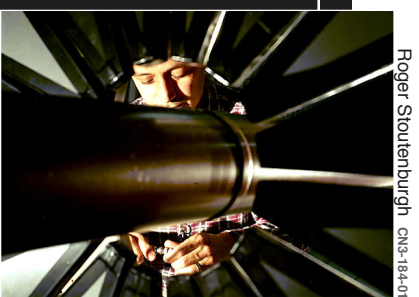
Inside the PHOBOS detector

the "Whiz Bang Science Show" — popular with both adults and children — will be shown at 10:30 a.m., noon, 1:30 p.m., and 3 p.m. every Sunday during the summer program.