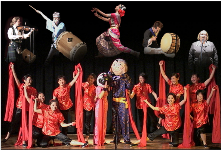
A composite photo showing some of the May 31 performers.

\Gamma riday, May 31, was a BNL evening to remember, when, at a dinner and concert in Berkner Hall, many BNLers and neighbors joined with the BERA Asian Pacific American Association (APAA) in their mission of celebrating the culture and achievements of Asian Pacific Americans and supporting American values through cultural connections.