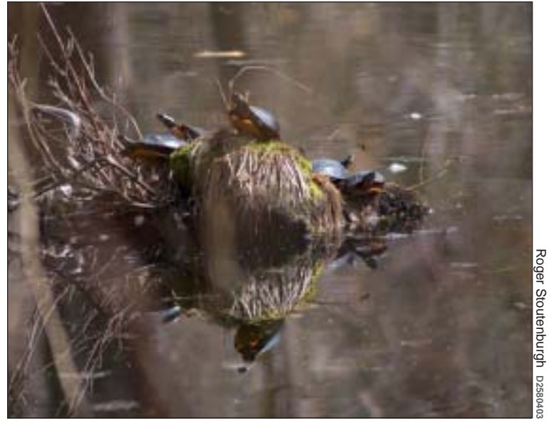
The long-awaited warmth of spring is not just a myth, or so these little turtles climbing out of the water to sun themselves seem to demonstrate. They were spotted last week by Lab Photographer Roger Stoutenburgh on site in a marshy area near the Peconic.