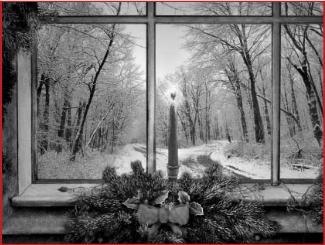
It looks as if in the coming months, there will be all too many opportunities to walk in a winter wonderland such as this beautiful scene on site captured last year by Lab Photographer Roger Stoutenburgh. The window dressing is virtual, however, added to the photo to suggest the glowing spirit of the season that the Bulletin hopes all BNLers and their families will enjoy over the holidays.

MK2838. POSTDOCTORAL RESEARCH ASSOCIATE – Requires a Ph.D. in chemistry, with experience in mechanistic inorganic chemistry with skills in synthesis and characterization of metal complexes/organometallics. Experience in flash photolysis and electrochemistry is highly desirable. Research of the group focuses on mechanistic and kinetic studies of photochemical H 2 production, CO 2 reduction and small molecule activation (H 2 , CO, hydrocarbons, N 2 , etc.) using transition metal complexes in solution. Various techniques are used