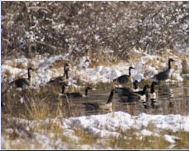
Roger Stoutenburgh D01361205