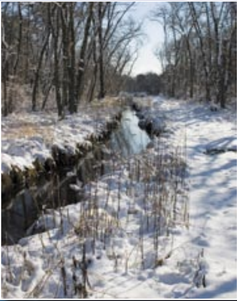
Roger Stoutenburgh D0081205