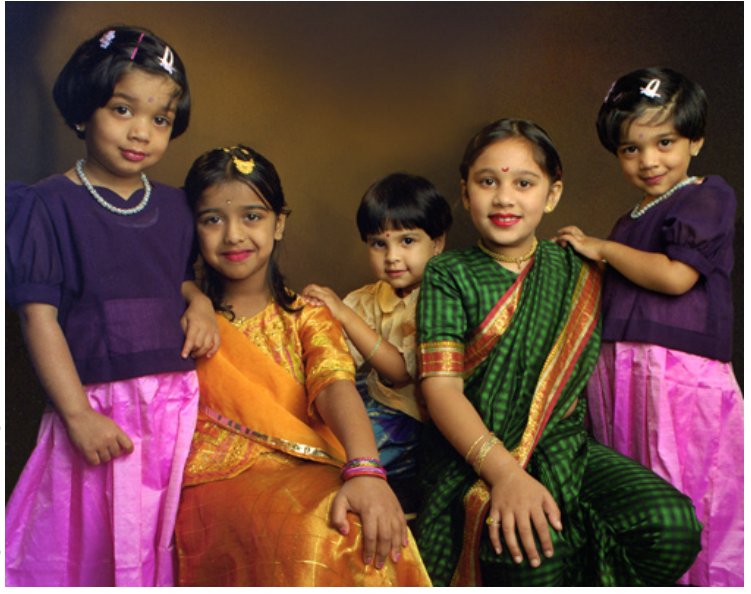
This photo shows some of the younger performers who danced in the 1999 Diwali Festival arranged by the BERA Indo-American Association.