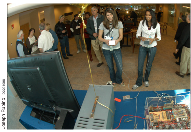
Two BNLers play Tennis for Two on the 5-inch oscilloscope; onlookers can watch the game on a larger television.