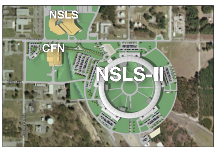
This currently planned configuration for NSLS-II shows the new facility close to the existing NSLS and Center for Functional Nanomaterials.

NSLS-II will be a medium-endesign that will deliver worldleading brightness and flux and