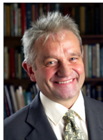
Nobel Laureate Paul Nurse, President of Rockefeller University

In the 11 a.m. lecture, titled “Controlling the Cell Cycle,” Nurse will explain that growth and reproduction of all living organisms are dependent on the cell cycle, the process that leads to cell division. Uncontrolled division of cells can lead to disease, especially cancer. Two phases in the cell cycle — the synthesis phase, the stage at which DNA synthesis or replication occurs; and mitosis, a process that results in the production of two daughter cells from a single parent cell — are controlled by enzymes called cyclin-dependent kinases, or CDKs. Checkpoint controls working through the CDKs