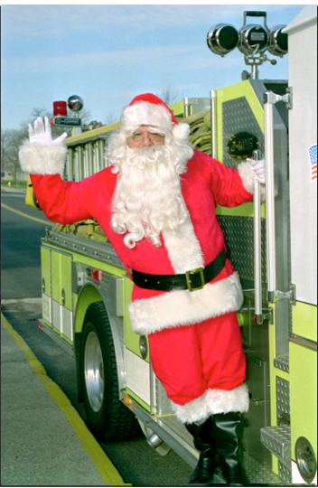
Michael Herbert c1-1-00

YAMAHA UPRIGHT PIANO – mint cond, beautiful sound, oak case, Yamaha Model 302, matching bench, $1300. Lorraine, 689-7326 or lsj22j@gmail.com.