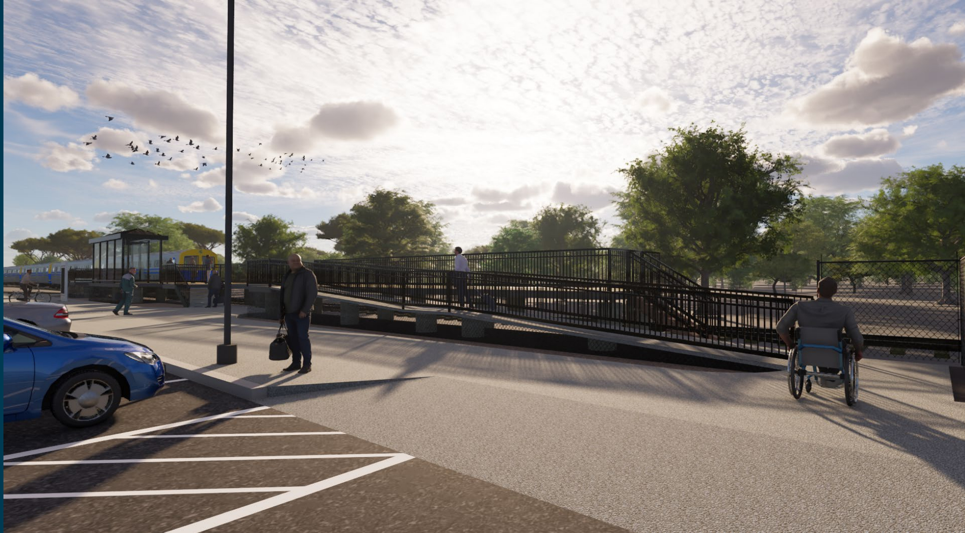
RENDERINGS: ADA RAMP