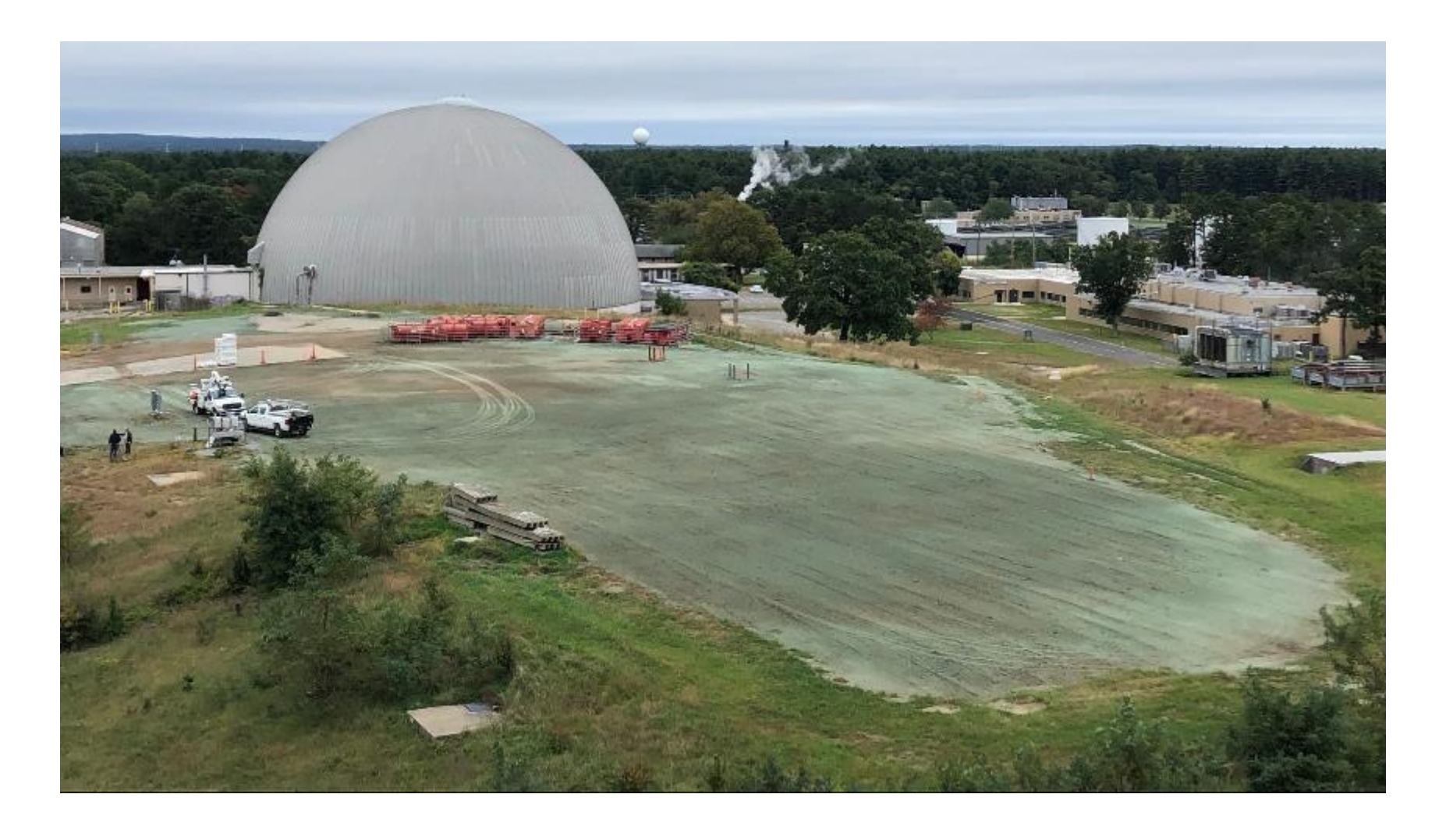
Hydroseeding looking east (OCT21).