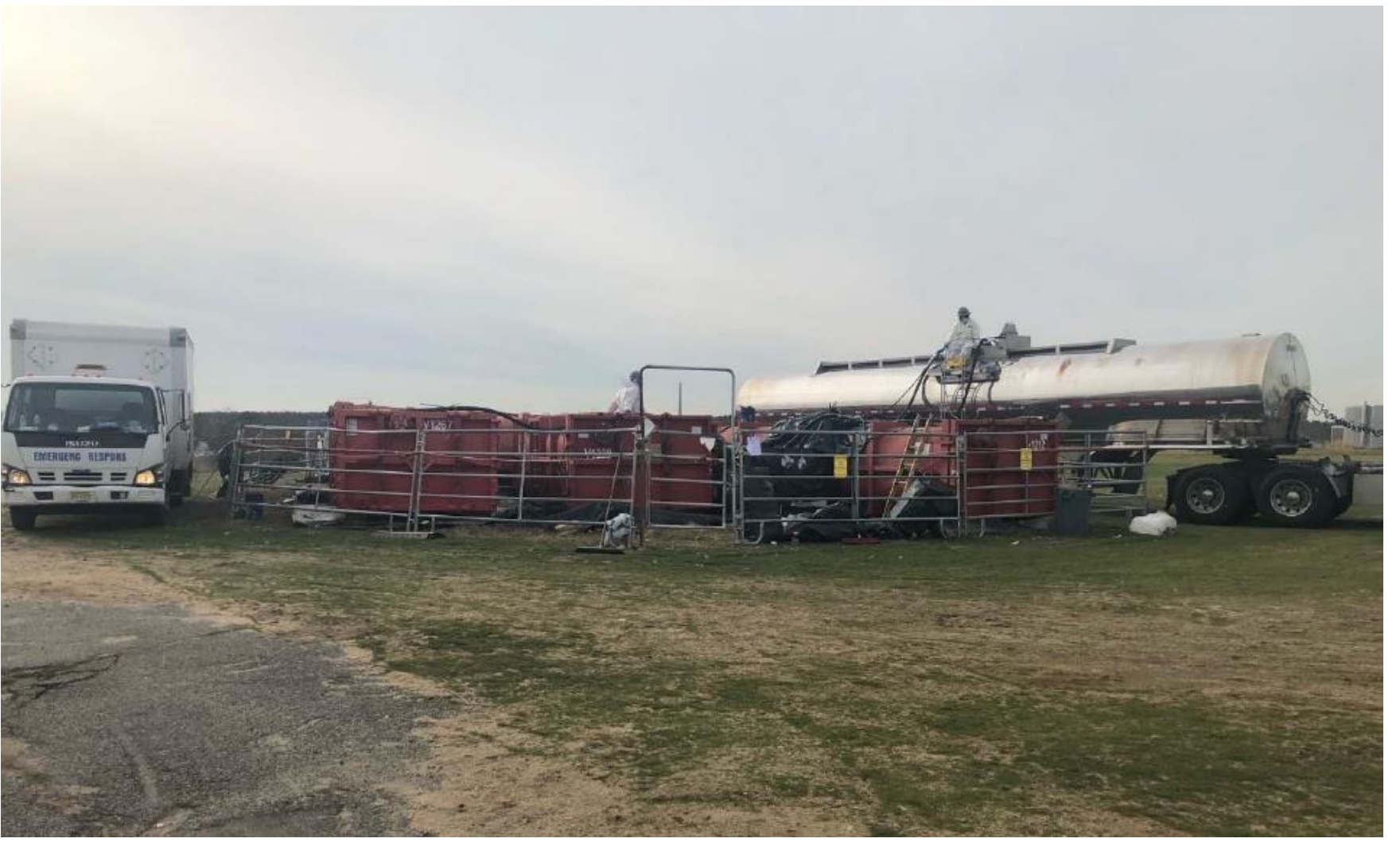
Wastewater from paint abatement project being transferred from temporary storage tanks to tanker trucks for disposal (DEC21).