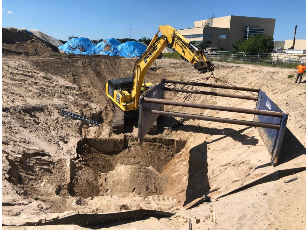
Trench box being removed from the silencer excavation area