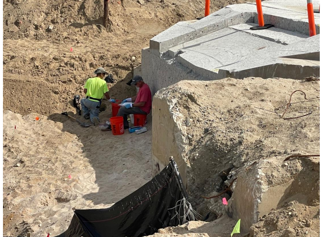
Final Status Survey (FSS) sample collection by OFJV/Cabrera