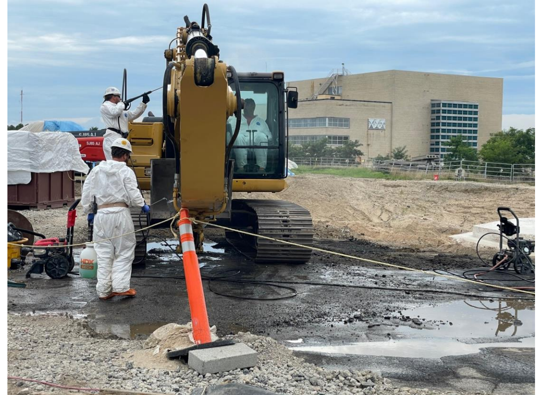
Final decontamination of equipment prior to being screened for radiation to permit release from the site.