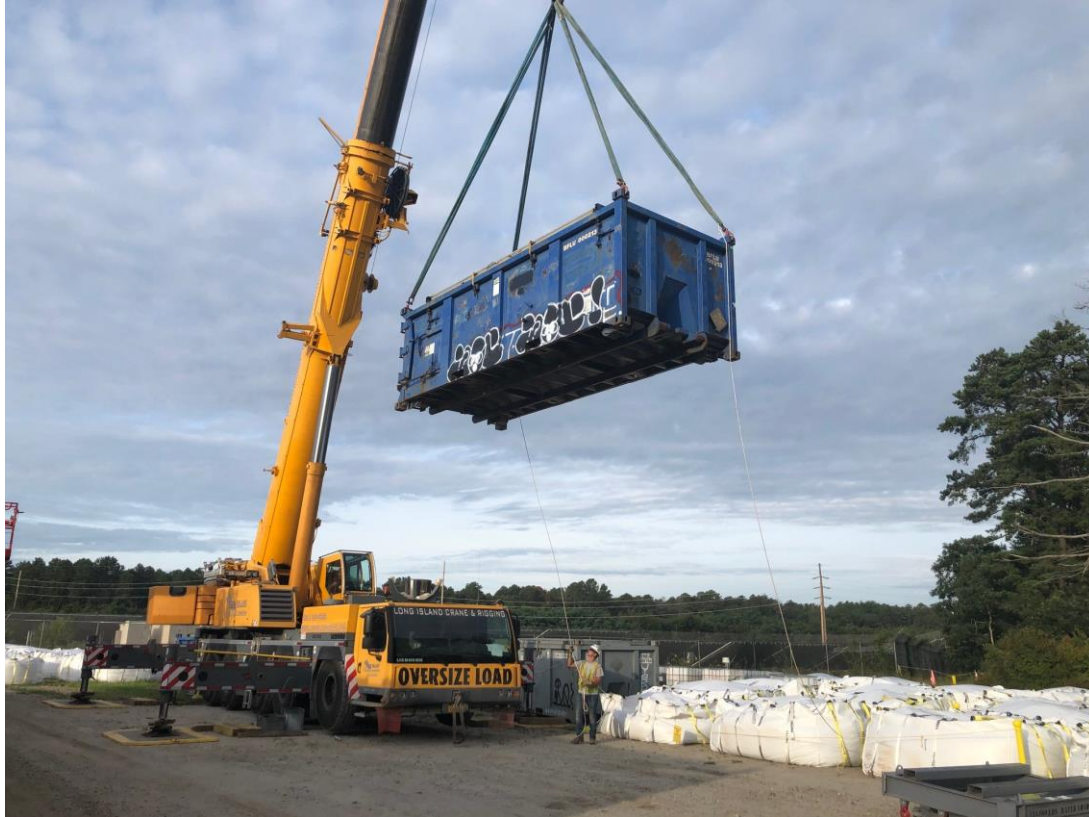
Loading Intermodal Containers (IMCs) at the rail yard for shipment of contaminated debris by rail for disposal. White sacks contain contaminated soil that was also loaded to rail cars.