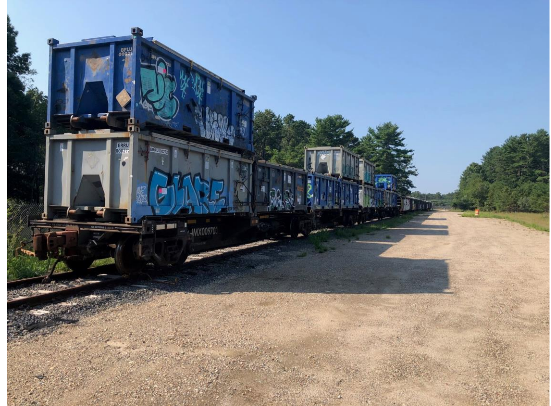
Rail cars fully loaded with demolition debris and soil. Last rail waste shipment left the site on August 30, 2021.