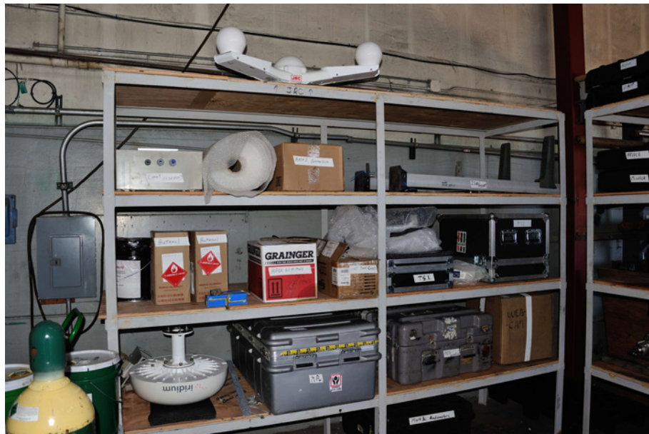
Spare parts, supplies, etc., carefully packed and labeled in one warehouse.