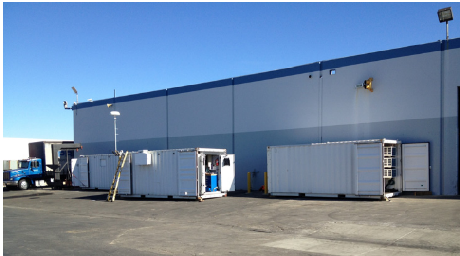
The three AMF2 vans at another warehouse.

The current plan is to use the down time to service instruments, have first looks at the data, etc., and then reinstall everything when the Spirit returns from dry dock in late April or early May, after which we will (hopefully) continue operations uninterrupted until the end of September, 2013. That will provide us with an additional five months of data in addition to the three we have already.