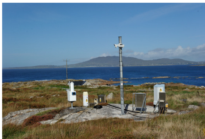
Looking toward the east.

Now comes more fun – figuring out what we can learn from all the measurements we've taken over the last year. There are many people I know who have already started, or have expressed an interest in, working on MAGIC data, but there are many others who are probably not aware of all that MAGIC has to offer. I am doing all I can to remedy this situation. I was in Ireland last week at a conference on sea spray aerosol production, and I used the opportunity to discuss the MAGIC campaign and MAGIC