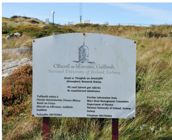
Mace Head, Ireland

I leave shortly to catch my flight to Long Beach. The Spirit arrives in port tomorrow morning, and the AMF2 and all MAGIC instruments will be removed from the ship, taken to a warehouse, and prepared for their journey to Finland, where they will remain for most of 2014 for another field campaign. It's hard to believe that the measurement phase of MAGIC is completed – it seemed like just the other day when it all started. It's been an incredible ride, and it has succeeded beyond my wildest expectations. We've been incredibly fortunate in many ways. So far we've installed the instruments on the ship twice and removed them once, and we've been blessed with perfect weather each time. The forecast for the rest of the week is for sunny skies also, so our good fortune continues.