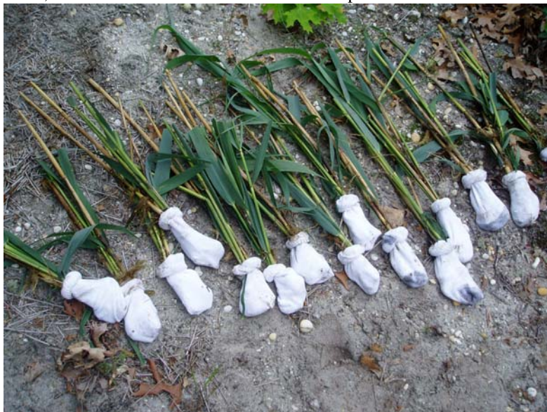
Figure 2: In order to mimic the full structural and chemical effects of Phragmites australis at sites with high levels of invasion, mini “stands” were made that could be placed in each enclosure.

Individual water samples were taken at each site and water quality was measured using a YSI instrument. Tadpoles were kept in aquatic mesh enclosures with PVC framing to eliminate predation as a variable. Each site had six enclosures and each enclosure contained six tadpoles. The enclosures were checked once a week to monitor basic environmental conditions and tadpole survival. Dimensions of the enclosures at sites with no invasion and medium invasion were 66cm x 58.4cm x 50.8cm. At sites 2 and 5 (heavy invasion), the dimensions were 66cm x 58.4cm x 66cm. At each site, detritus was raked from the pond bottom and dried to eliminate macroinvertebrates. 200 grams of the dried detritus were added to each enclosure to provide food. At sites 2 and 5 only, the effects of P. australis were simulated within each enclosure by constructing mini “stands”. Two rocks were placed in a sock for weight and five stalks of P. australis with root bundles were cut to approximately 16 inches in length and added to the sock. The top of the sock was tightened shut using rubber bands to create one “stand”. Each enclosure received four “stands.” Figure 2 depicts the completed “stands”.