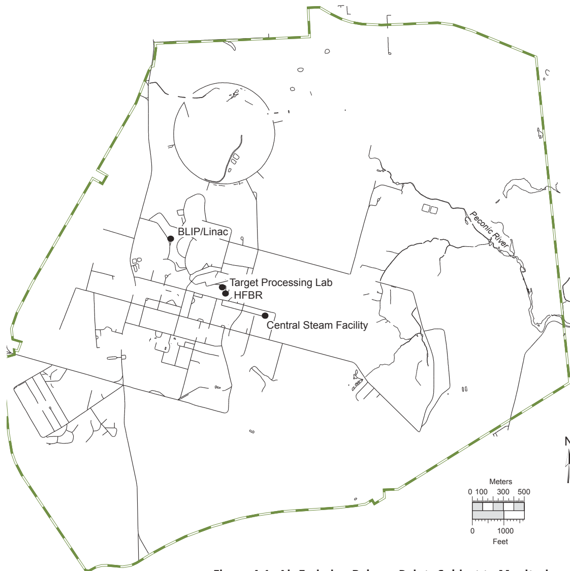
Figure 4-1. Air Emission Release Points Subject to Monitoring.