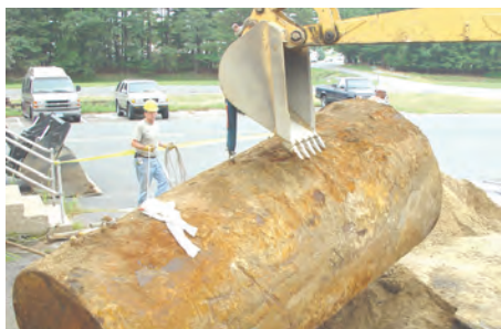
FIGURE 4. Removal of an empty underground storage tank.

building rainwater downspouts were repaired and reconfigured, the paved area south of the building was resealed, and a concrete cap was installed over the remaining areas around the building.