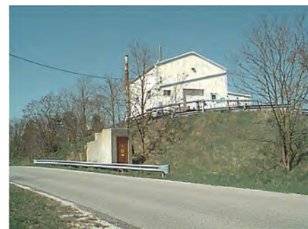
FIGURE 3. BLIP facility.

prevent additional rainwater infiltration, controlling rainwater runoff, and conducting additional groundwater monitoring. Although the cap has been effective in preventing additional leaching, some of the tritium previously transported to the deeper soils has been flushed into the groundwater when the water table naturally rises following periods of heavy rainfall. As a result of this flushing activity, three small, high-concentration "slugs" of contamination were released to the groundwater, with tritium concentrations reaching a maximum of 3.4 million pCi/L in June 2002. For the past two years, tritium levels in the groundwater downgradient of the source have dropped to less than 100,000 pCi/L.