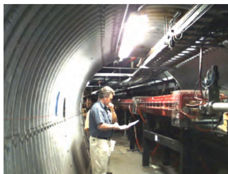
FIGURE 2. Inspecting the g-2 beam line.

The g-2 experiment was conducted from 1997 through 2001 on an independent beam line originating from the Alternating Gradient Synchrotron (AGS) facility. In November 1999, BNL detected tritium in the groundwater near the g-2 experiment at concentrations of about two times the 20,000 pico curies per liter (pCi/L) drinking water standard. An investigation into the source of the contamination revealed that the tritium originated from activated soil shielding located adjacent to the g-2 target building. The soil became activated, or radioactive by the accelerator beam inadvertently striking one of the magnets in the target building. Rainwater then leached tritium from the soils and carried it into the groundwater. Corrective actions were implemented starting in December 1999, including re-focusing the beam to significantly reduce beam losses, improving beam loss monitoring, installing a concrete cap over the activated soil area to