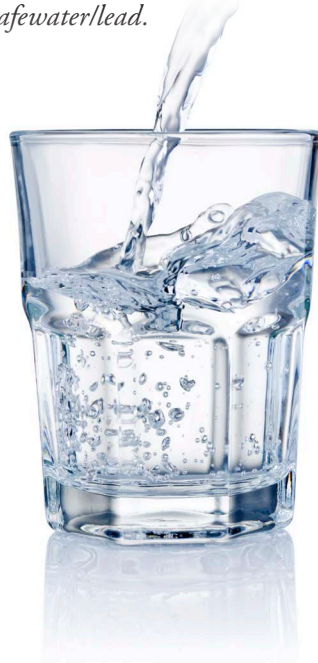
2015 Lead and Copper Sampling Results

Information on lead in drinking water, testing methods, and steps you can take to minimize exposure is available from the Safe Drinking Water Hotline (1-800-426-4791) or at http://www.epa.gov/safewater/lead .