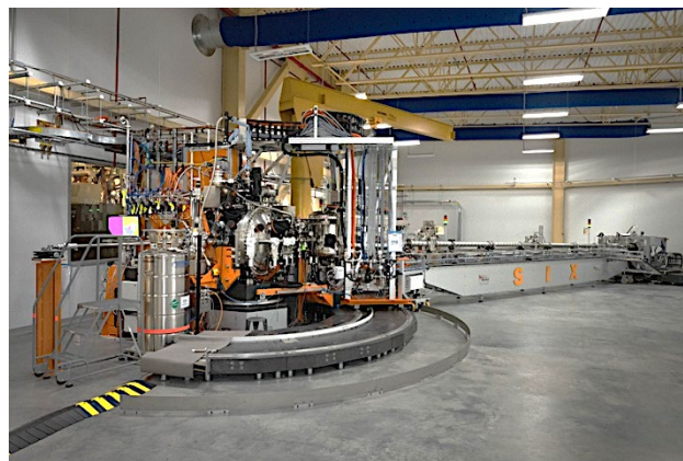
The 2-ID Beamline SIX of the NSLS-II: Its 15m long spectrometer arm is located in a separate building annexed to the NSLS-II experimental floor

Why do scientists need to perform Resonant Inelastic X-ray Scattering experiments? Let's think about a game of pool. Player 1 cues the ball first and it hits a firm cushion bouncing back without losing speed being able to strike other balls and reach the pocket. Then, Player 2 plays the ball into a soft cushion. When the ball bounces back, it gets strongly decelerated and stops. By looking at the way the balls get scattered around the table during the game, an observer can infer information about the pool table cushion that was hit each time. Similarly, scientists use RIXS to get information about their samples; in this case, the balls are replaced by the X-rays, and the table represents a selected material. By collecting the X-rays scattered off the sample, and by measuring their energy, scientists can reconstruct the energy transferred to the sample and thus the excitations created in the material.